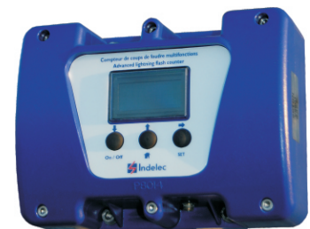
Advanced Lightning Flash Counter