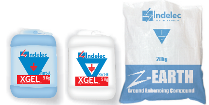
XGEL & Z-EARTH

XGEL and Z-EARTH associated together guarantee the most efficient earthing and the lowest resistance value for a very long time!