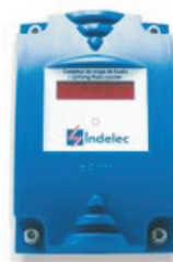
Digital Lighting Flash Counter

The latest version: INDELEC Advanced Lightning Flash Counter not only displays the number of strikes, but also the Date, Time and Current Intensity for each lightning strikes! In addition, an Optical Remote interface enables to monitor the data from a control room or office. For the most accurate monitoring and maintenance, this counter is a must!